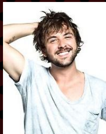
Darren McMullen - presenter

At just 32, Joel Madden has already achieved great success in his music career as a singer, record producer, and DJ. He is best known for being the lead singer of pop-punk band Good Charlotte.